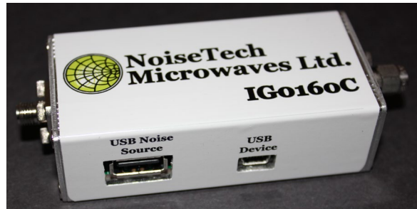
Fig. 1: IG0160C Impedance Generator.

The IG00335C frequency range is optimized for most commercial applications, such as WiFi, WiMax, LTE, 3G and 4G, Bluetooth wireless standards.