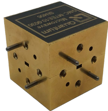
WR-10 Magic Tee Drawing